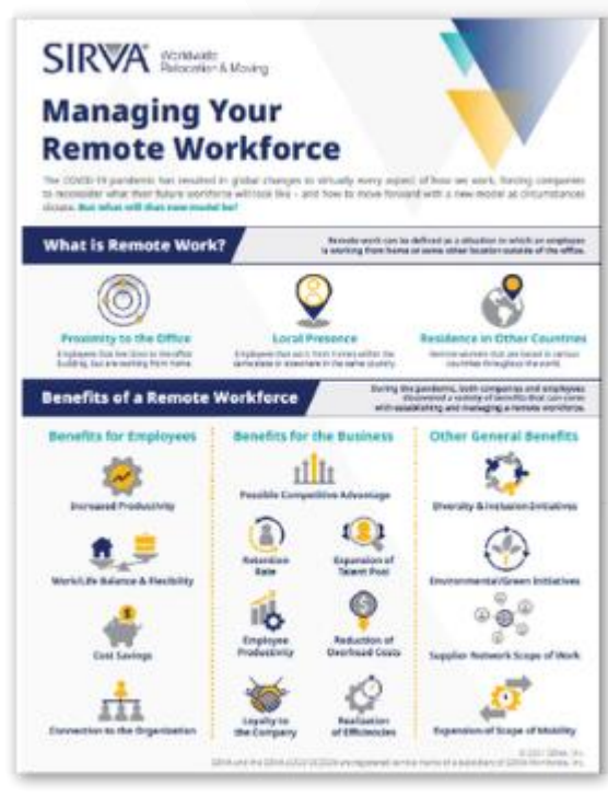
Click to view our remote work infographic

You may be able to reduce office space, equipment and amenity costs.